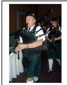
Fort Wayne Pipes & Drums

The highlight of the Gathering for me was, without a doubt, the wonderful Fort Wayne Pipes & Drums who opened our Saturday night gala with their presentation of bagpipe music. Saturday night also gave me and my immediate family a reason to have a family reunion, with cousins coming from as far away as California and Florida.