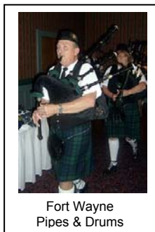
Fort Wayne Pipes & Drums

The highlight of the Gathering for me was, without a doubt, the wonderful Fort Wayne Pipes & Drums who opened our Saturday night gala with their presentation of bagpipe music. Saturday night also gave me and my immediate family a reason to have a family reunion, with cousins coming from as far away as California and Florida.