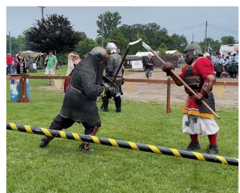
Medieval Fighting Demonstration