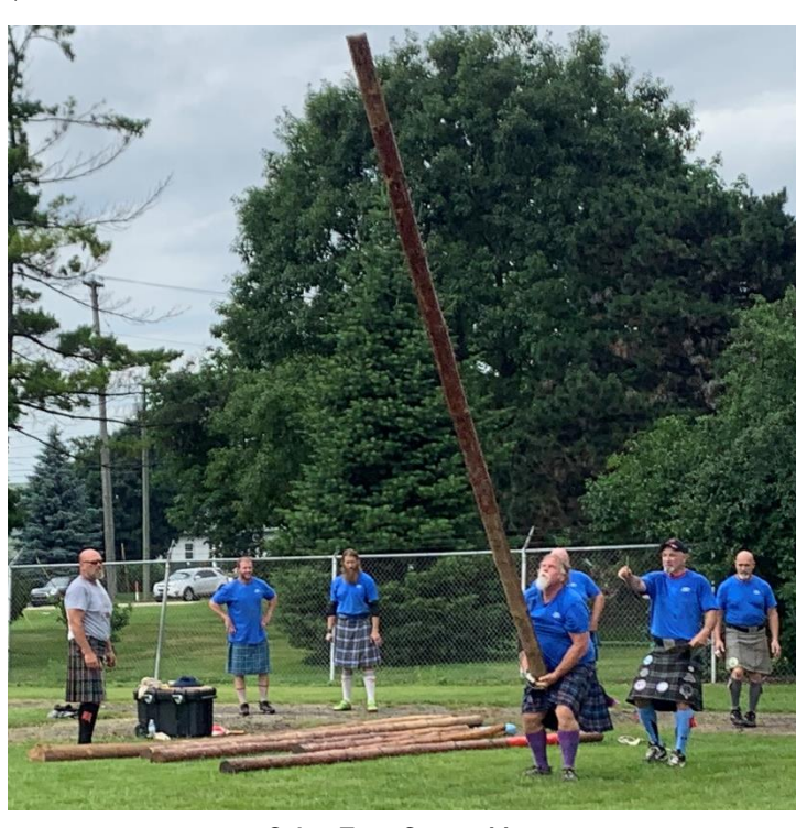
Caber Toss Competition