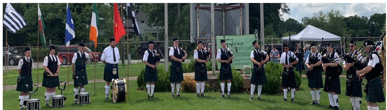
Pipe and Drum Band from Fort Wayne, IN