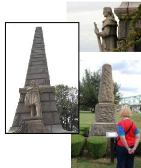
Commemorative Obelisk, Frontiersman Statue, Chief Cornstalk Monument

At the junction of the Ohio and Kanawha Rivers stands this monument which commemorates the frontiersmen who fought and died at the Battle of Point Pleasant. This battle was fought with Chief Cornstalk on October 10, 1774, and is recognized as the decisive engagement in a proactive series of Indian wars. The name 'Tu-Endie-Wei' is a Wyandot word meaning 'point between two waters'. The Pt. Pleasant Battlefield Monument was erected on October 10, 1909, as a tribute to a battle fought on this same date in 1774.