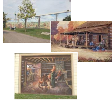
Murals, Daniel Boone Cabin Mural, Murder of Chief Cornstalk Mural

For further information, visit tinyurl.com/PtPleasantMurals .