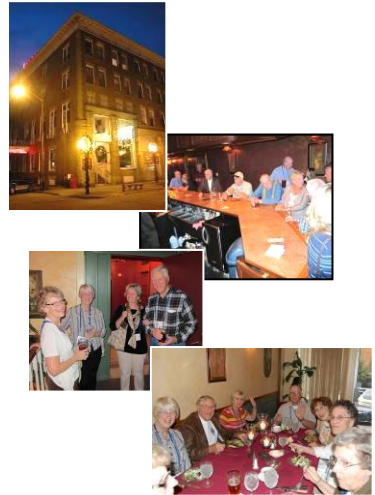
Lowe Hotel, 'Ewing Barristers', 'Ewing Standups', One of Many Dinner Tables