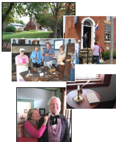
Back Garden, Entry, Kitchen, Writing Table, The Proprietor

Our House – a three-story brick tavern in the Federal style – was built in Gallipolis by Henry Cushing in 1819. The tavern boasted, in addition to its taproom, dining room, and other usual facilities, a large ballroom for social functions. On May 22, 1825, General Lafayette visited Gallipolis and was entertained at the tavern. Gallipolis still celebrates Lafayette's visit with a ceremony each spring. The Cushing family owned and operated Our House until 1865. The restored tavern and inn contains period furnishings and offers a display of early Americana. Visitors today will step back in time to when proprietor Henry Cushing invited weary travelers to stay at his inn.