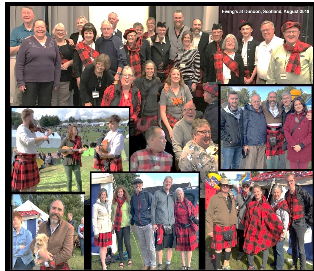
Memories . . . 1 st International Clan Ewing Gathering, Scotland, 2019

Our plan remains for the next Gathering to be held in Philadelphia, PA and Greenwich, CT. Information will be sent later this year as we are able to reconfirm our reservations with the hotel and museum we wish to visit. In the meantime, please feel free to take a virtual tour of a number of historic homes in Greenwich by visiting the Cumberland County Historical Society NJ YouTube channel.