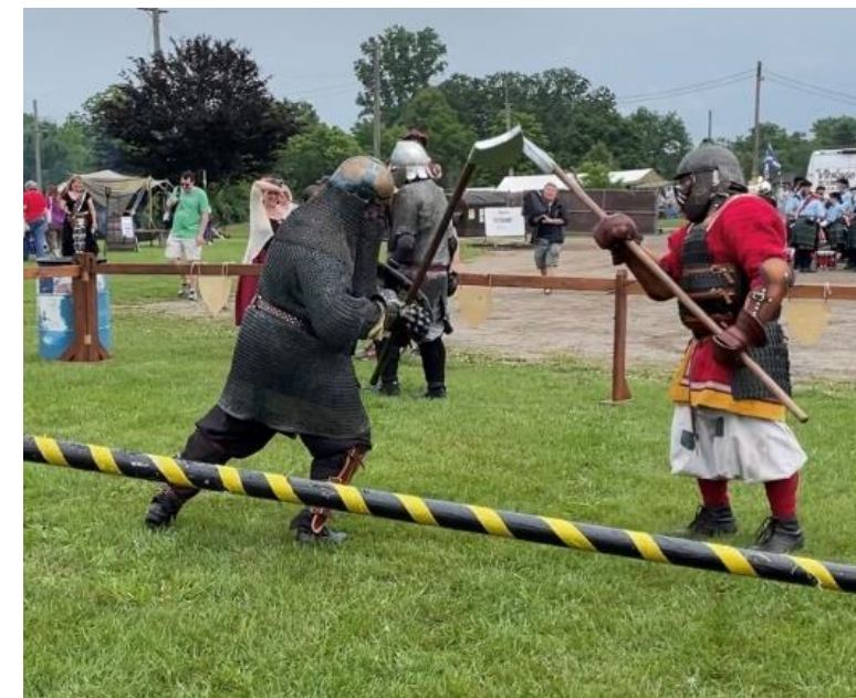
Medieval Fighting Demonstration