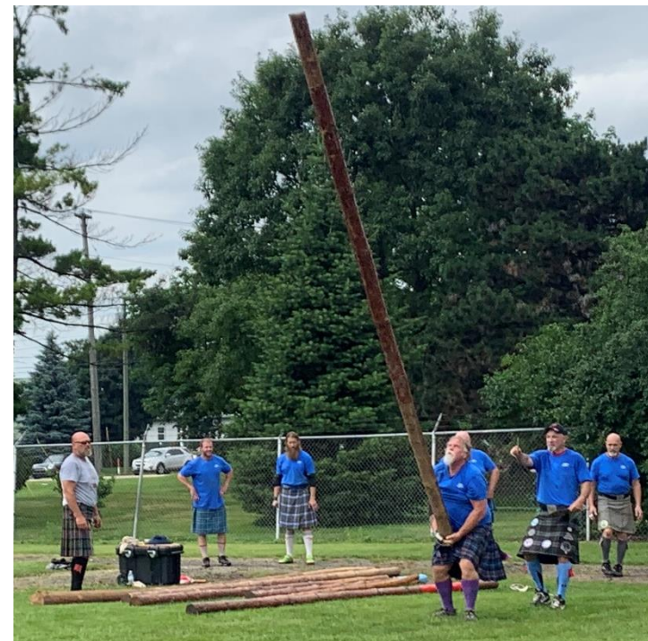
Caber Toss Competition