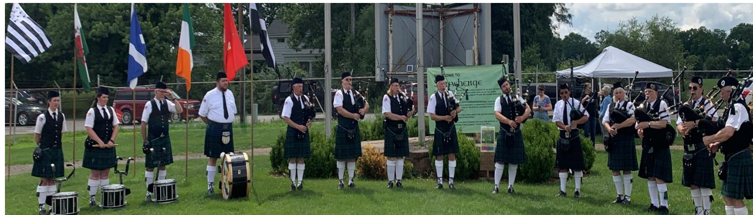
Pipe and Drum Band from Fort Wayne, IN