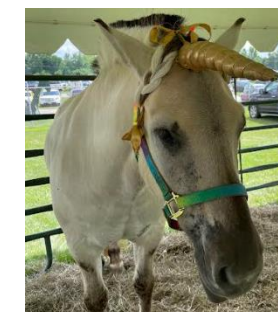
Real Live Unicorn!