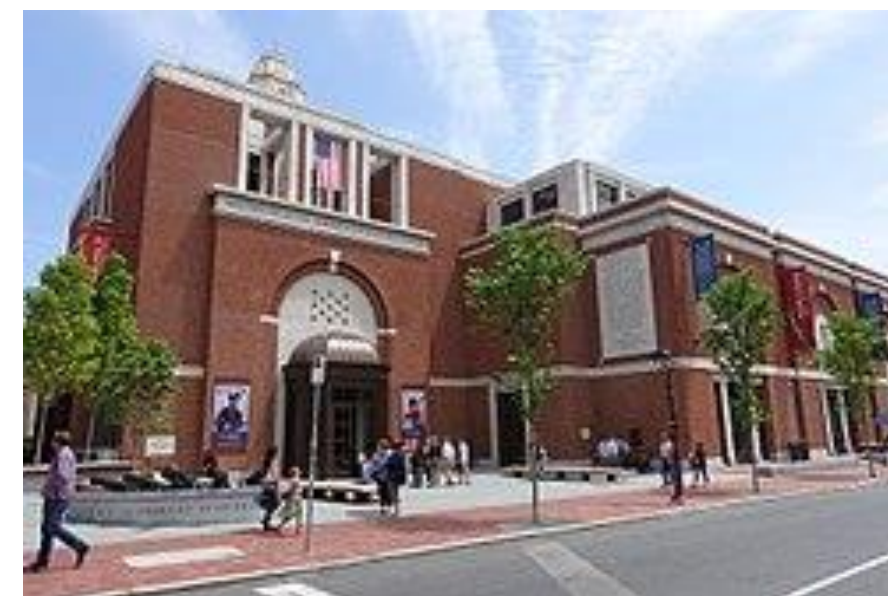
Museum of the American Revolution

A new updated Registration form will be posted on-line and will also appear in the November 2020 issue of the Ewing Family Journal .